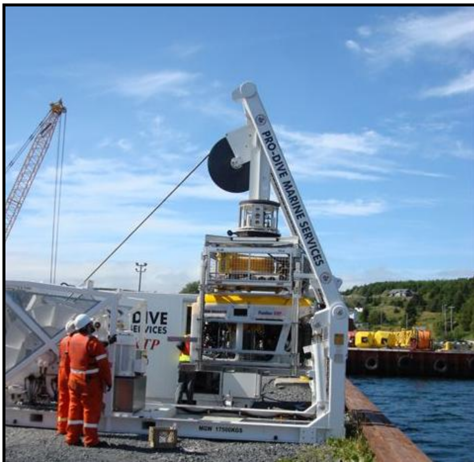
Panther XTP A-Frame LARS and TMS with Snubber Rotator